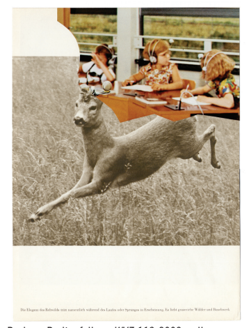
Barbara Breitenfellner, WVZ 118, 2009, collage, FNAC 09-609, Centre national des arts plastiques